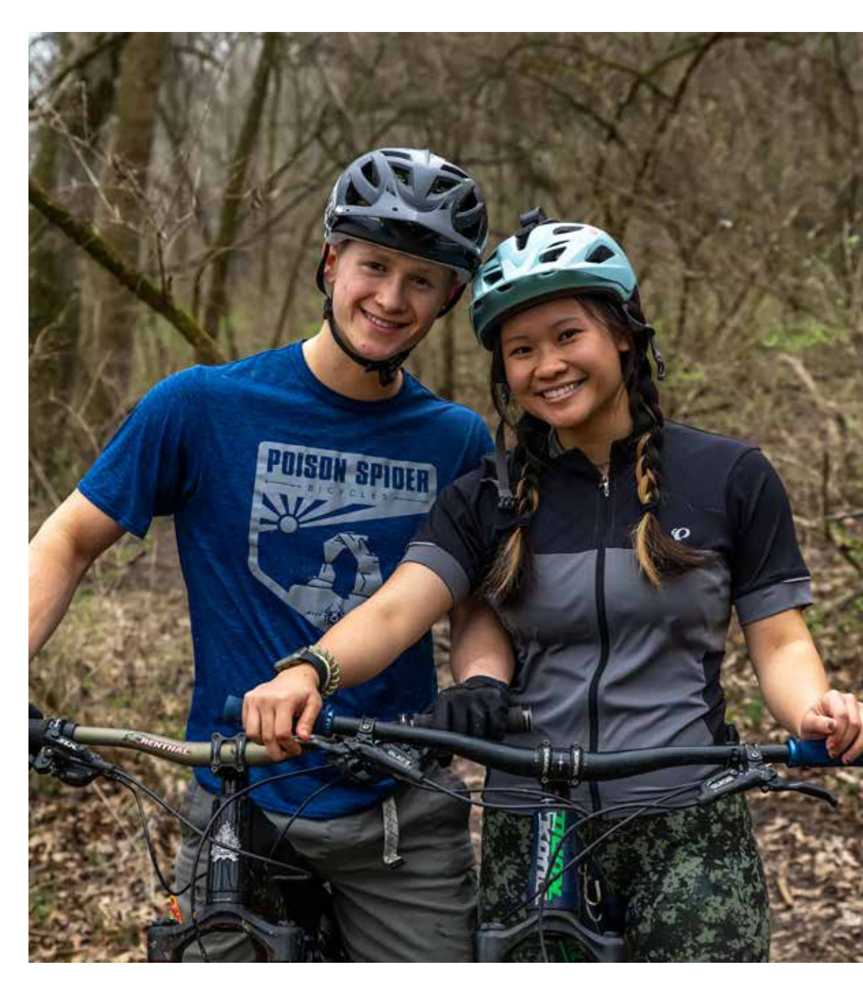
BIKE WALK BRENTWOOD IS PARTNERING WITH CITY OFFICIALS TO DESIGN BIKE TRAIL SYSTEM AT MARCELLA VIVRETTE SMITH PARK

Brentwood is home of the sixth-grade girls' first and third place finishers at the 2021 Tennessee National Interscholastic Cycling League state championship races, as well as the fourth place freshman boys' finishers. Yet, the process of creating Brentwood-based mountain bike trails to date has been a decade in the making. Local cyclists say they're starting to see better flow days ahead, though.