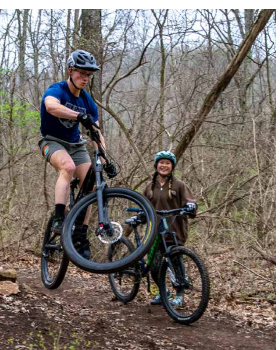
APRIL 2022 I CITYLIFESTYLE.COM/BRENTWOOD 41